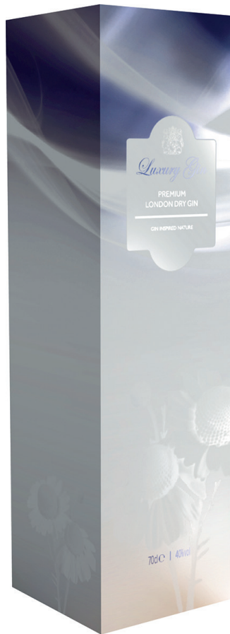
Day Time Packaging Shines Metallic

The Color-Logic Image-FX feature is a photorealistic image separation algorithm that analyzes images and calculates the required metallic effect for the different tonal regions of the image. This plug-in for Adobe Photoshop CC and higher automatically creates an effect printing plate for use with a metallic silver ink. If printing is to be done using metallic substrate, the effect printing plate can be manipulated to output for white ink printing. This automated process eliminates the time consuming, trial and error method of integrating metallics into an image and only places metallic ink where it is required, using an advanced algorithm which also acts as an ink reduction tool.