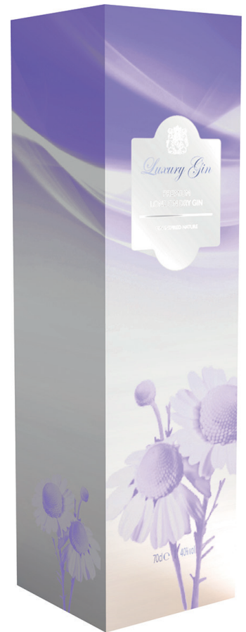
Night Time Packaging Glows under UV light

The luxury packaging on the left above was created using a complex white ink mask, generated using the Color-Logic Image-FX plug-in. The package on the right was printed using the same plate to apply light-reactive ink which glows under ultraviolet light. This permits the elegant box package to retain its esthetics during day and night.